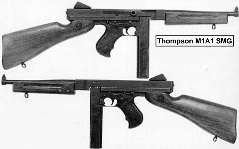
Thompson M1A1 SMG