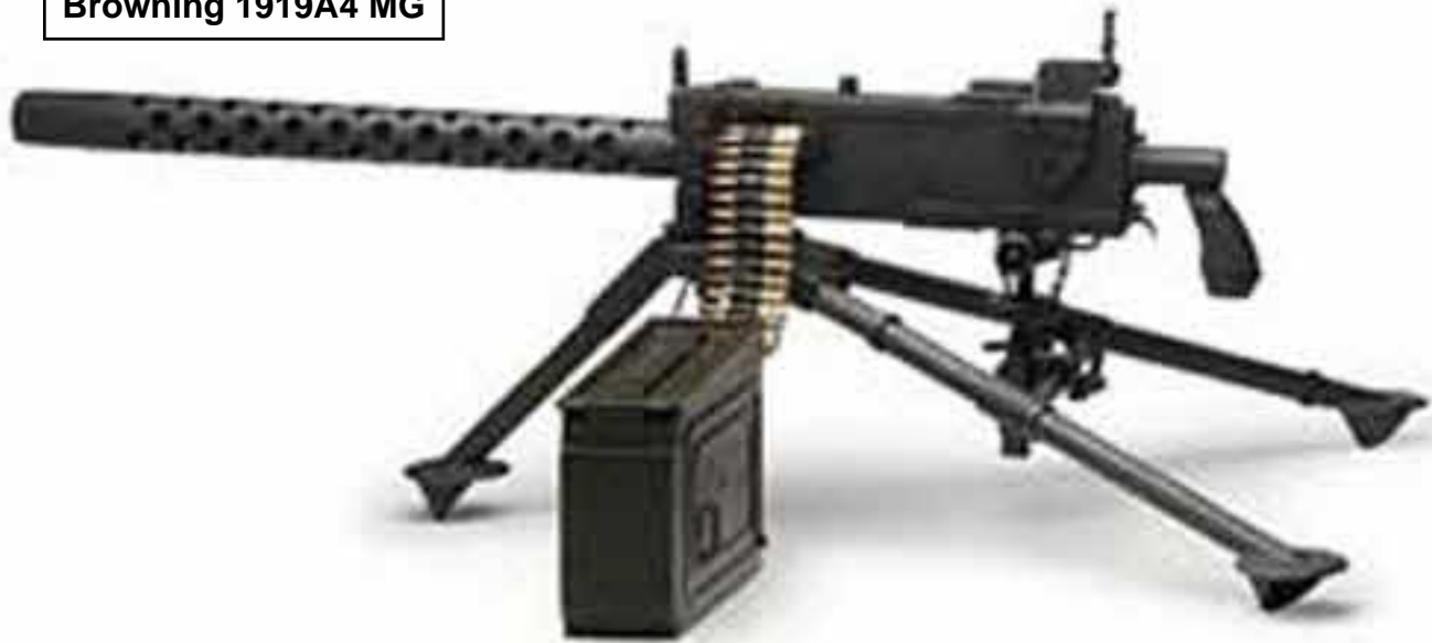
Browning 1919A4 MG